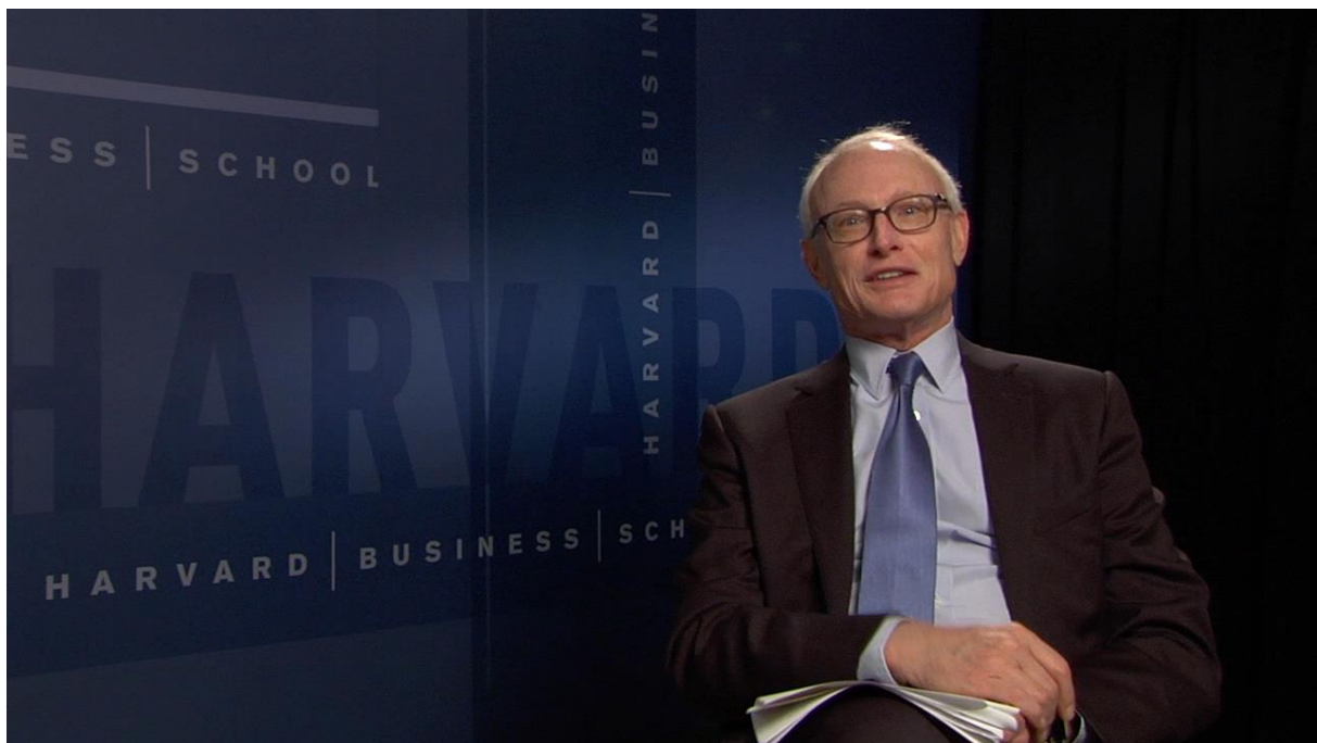
Michael Porter Address during the Annual European MOC workshop in Fribourg on September 9 th , 2013. Available on http://unifr.ch/competitiveness/en/events .