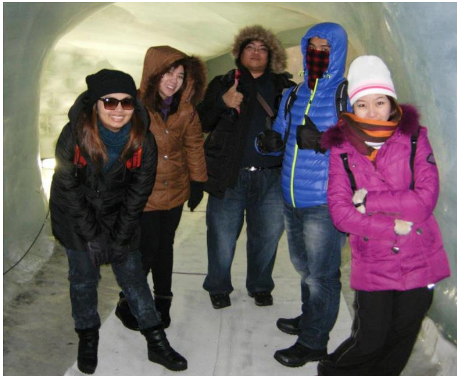
NIDA Students enjoying Winter season at the MOC course in Fribourg in January 2013.