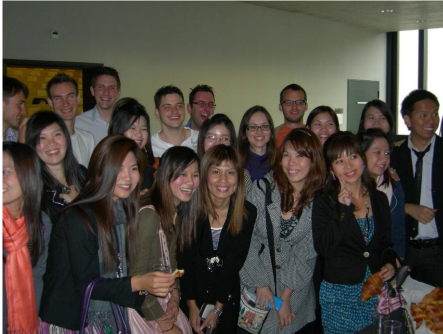
NIDA students attend regularly MOC courses at the Center for Competitiveness in Fribourg.

University of Fribourg in November 2013. The course duration was 2 ½ days. A class of NIDA Students attended one week MOC course at the Center for competitiveness in Fribourg in January 2013.